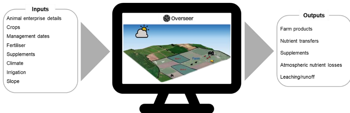
Figure 1: Schematic demonstrating the basic flow of nutrients throughout the Overseer model at the farm block-scale, including management actions (e.g., dates of interventions, crop types, animal types) that ultimately impact the available nutrients.

nutrient dynamics, providing actionable insights. The platform tracks key nutrients – nitrogen (N), phosphorus (P), potassium (K), sulphur (S), calcium (Ca), magnesium (Mg), and sodium (Na) – and reports on GHG emissions, including methane (CH 4 ), nitrous oxide (N 2 O), and carbon dioxide (CO 2 ). CO 2 reporting accounts for upstream emissions (e.g., manufacturing and transportation) embedded in materials and energy used on-farm. Losses are categorized by transfers to products, leaching below the root zone, air, and animal-related processes (e.g., effluent or supplements).