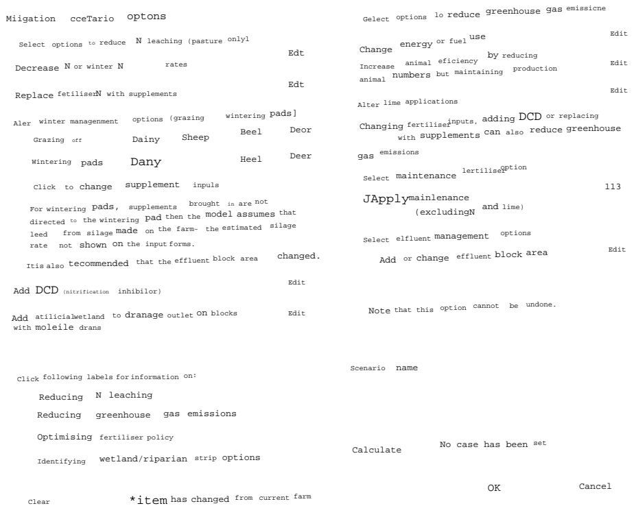
Fig. 2. Screen shot of the pre-set mitigation scenario options within Overseer model

For example, use of nitrogen fertiliser, the import of supplements to the farm, or the creation of feed pads, winter pads or animal shelters frequently requires the area that effluent is spread over to increase. The spreading of effluent over a wider area can also affect of the amount and type of fertiliser recommended for different blocks.